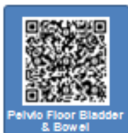
Pelvic Floor Bladder & Bowel