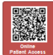
Online Patient Access