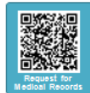
Request for Medical Records